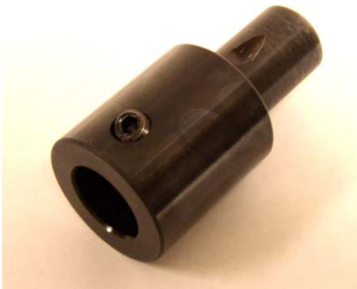
QRT PUNCH HOLDERS 010-04-QRT AND 010-05-QRT

FOR MORE INFORMATION CONTACT: TERRY STEFFEN AT MANCHESTER TOOL AND DIE testeffen@manchestertoolanddie.com (260) 982-8524